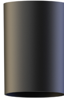
Black Exterior/Black Interior