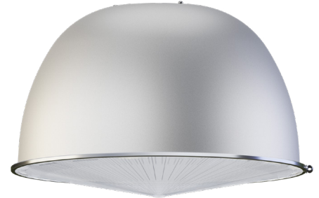
22" Reflector + 22" Conical Lens (Reflector not included)